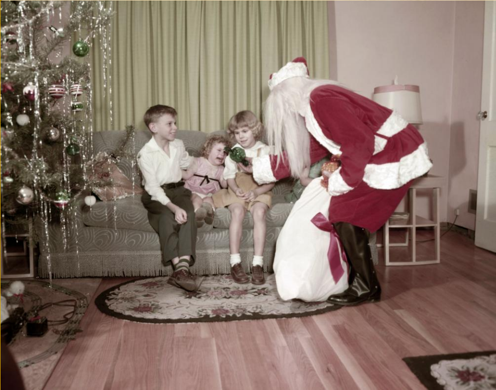
Most, but not all, children are delighted by Santa's visit. This photo from 1953 also perfectly captures the mid-century Modern decor of a Sharpsville home.