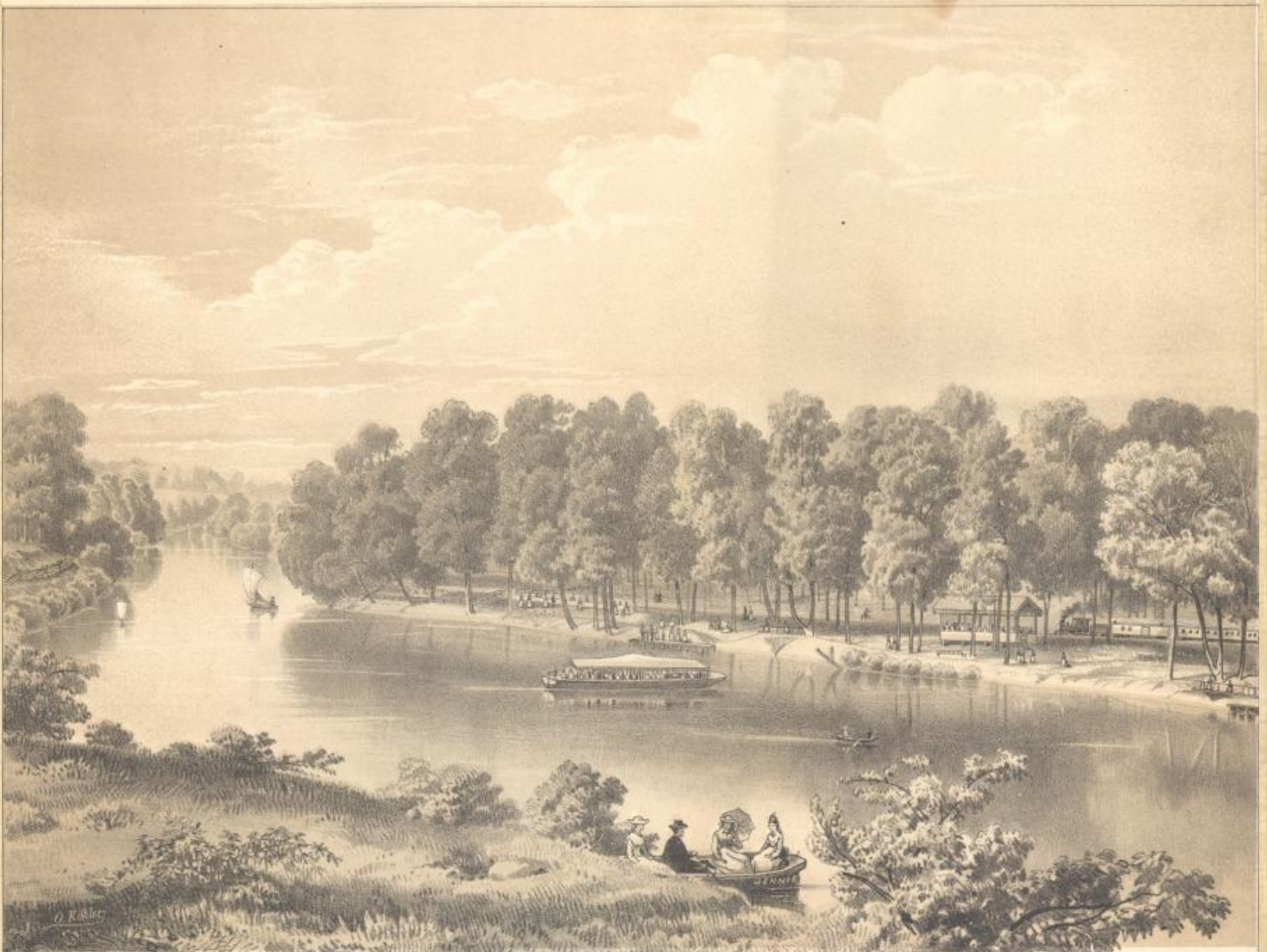
“SHADY SIDE.” TWO MILES ABOVE SHARPSVILLE, PA.

The area was one of the first recreation spots in what is now South Pymatuning Township and was extolled for its beauty. An account from 1915 claimed, “There is no more beautiful scenery along the Shenango river or in this part of