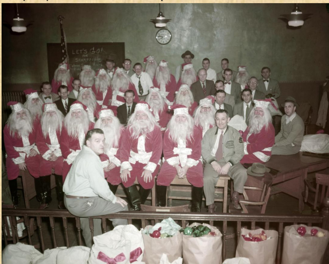
“Let's Go! For Sharpsville” reads the chalkboard behind the assembled Santas and Helpers. This was one of the 8 unpublished photos from the 1953 American Magazine article in our collection.

In 2006, the visits were changed from Christmas Eve to the evening of the 23 rd . Not only was it increasingly difficult to find Santas and Helpers to spend time away from their families on the 24 th , many households would miss a visit because they attended church or had other plans on that busy Eve.