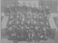
The 1922 High School Gridders Team is shown in their uniforms, posing for a group photograph. The team is composed of players and coaches.