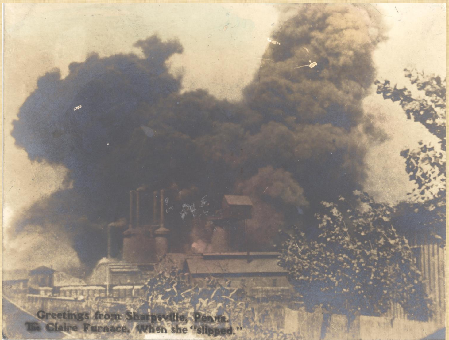
Greetings from Sharpville, Penna. The Claire Furnace. When she "slipped."